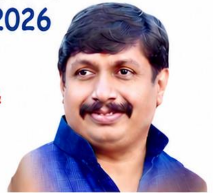
(President - Solapur District Chess Association) Hon. MP. Dhairyasheel Mohite - Patil

Champ Chess School & Next Move Online Chess Academy