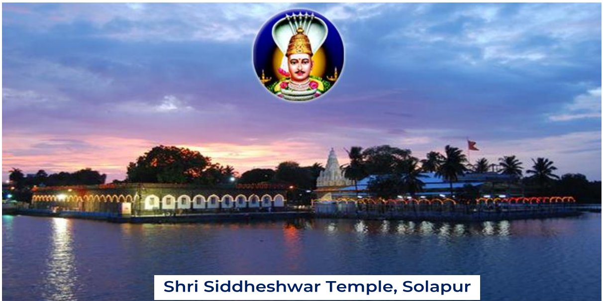
Shri Siddheshwar Temple, Solapur