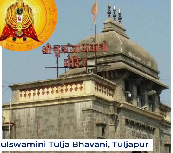
Kulswamini Tulja Bhavani, Tuljapur