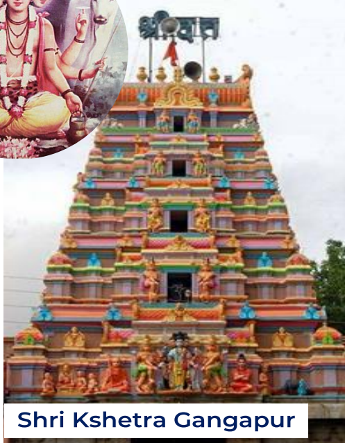
Shri Kshetra Gangapur